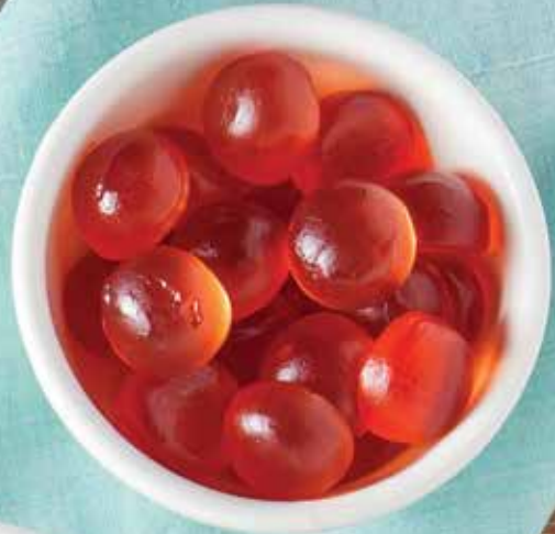
Honey Stinger Grapefruit Organic Energy Chews