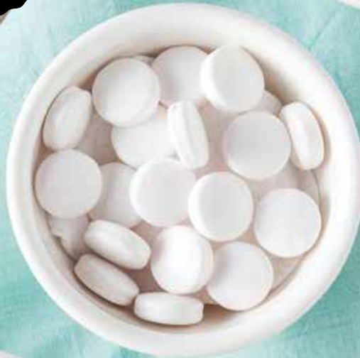
Run Performance Gum Mint