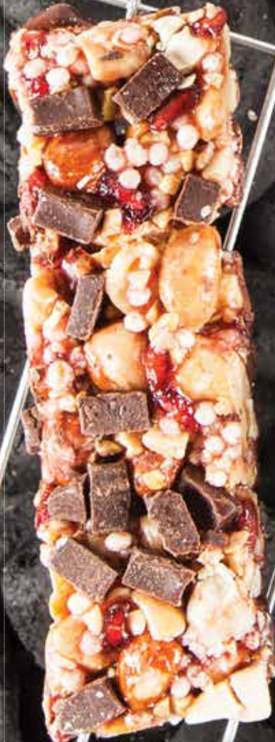
Clif Organic Trail Mix Bar Dark Chocolate Pomegranate Raspberry