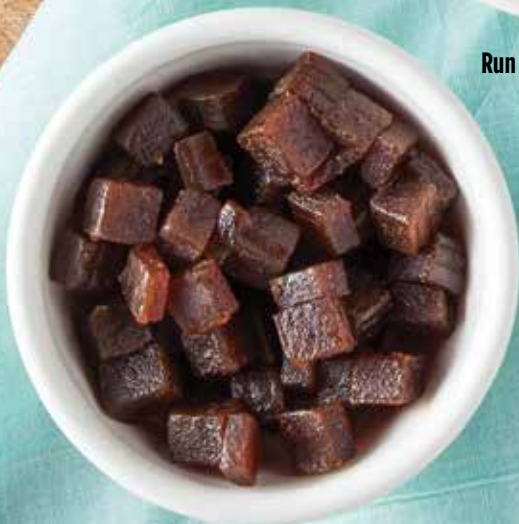
Baobest Bao Bites Peach Mango